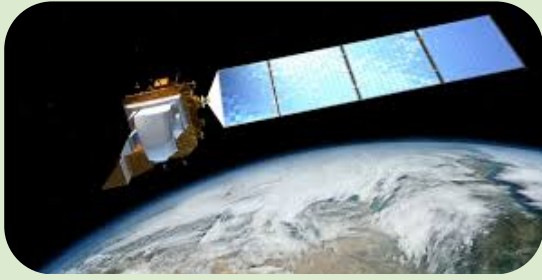
Landsat 8: https://www.usgs.gov/media/images/landsat-8-image-7

Alexia Berhend, Oreste Challandes, Héloïse Marques